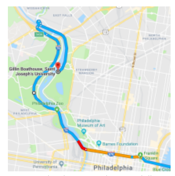
I-76 W Walt Whitman Bridge into Philly to

Some people like taking the Ben Franklin Bridge, but I only use that when leaving the races returning home.